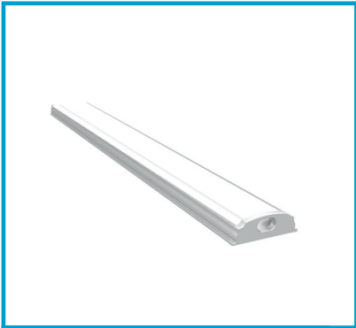
LED Bendable Profile PRO1806 IP20