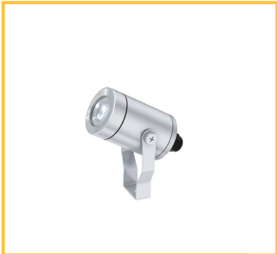
Floodlight Nano 2W 24V WW IP68