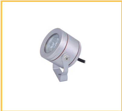
Floodlight Mini 4.8W 24V WW IP68