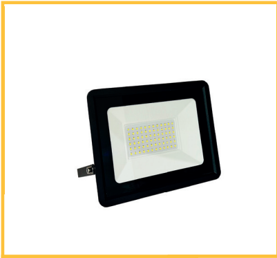
LED Floodlight IP65 G2