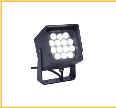
LED Floodlight FL121683065 15W 230V IP65