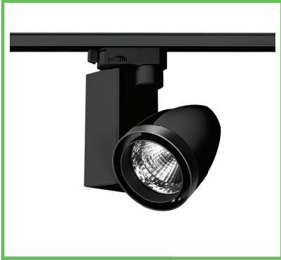
Track Light TLZ IP20