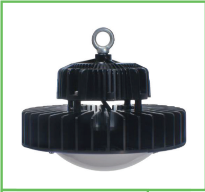
Highbay B-Bolt 100W NW IP65