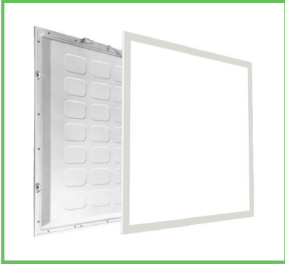
Square 595 x 595 52W Backlit Panel G3