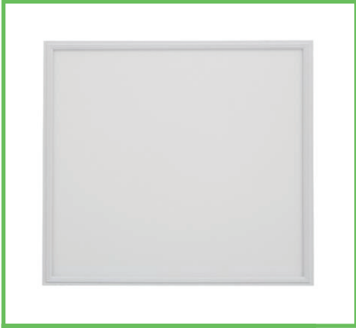
Square 595 x 595 40 W Slim Panel G2 IP40