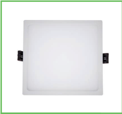
Square Recessed Slim Downlight IP20