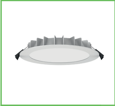
PRO Slim Round Recessed Downlight DPSRR IP54