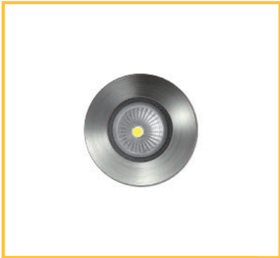
Inground Light UL0306 3W 230V IP67