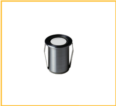
Inground Light UL01F 1.5W 24V WW IP68