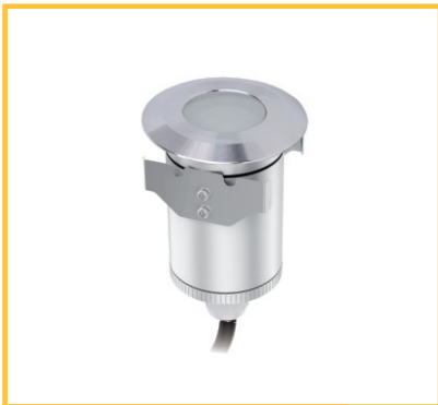
Inground Light Nano 2W 24V IP68