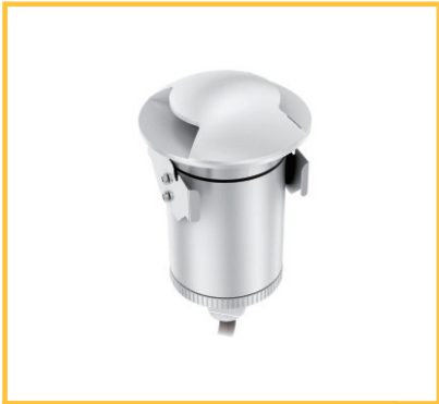
Inground Light Nano V2 2W 24V IP68