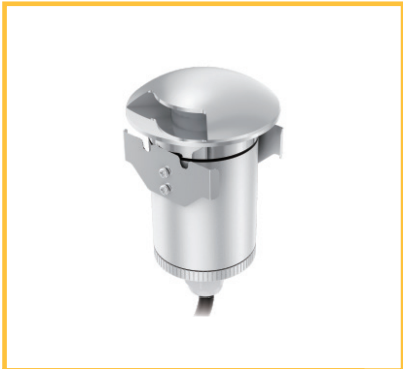
Inground Light Nano V1 2W 24V IP68