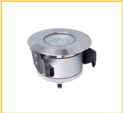
Inground Light Mini 4.8W 24V IP68