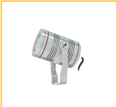
Floodlight Maxi 11.5W 24V WW IP68