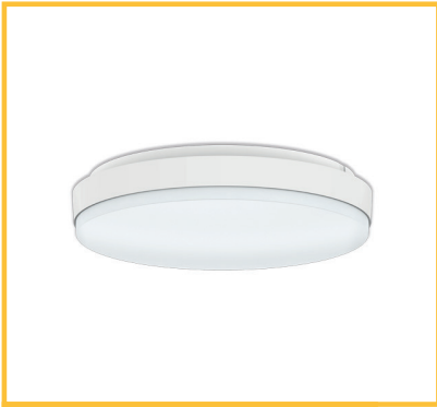
Ceiling Surface Mounted Fixture CLSM2818 3CCT IP65