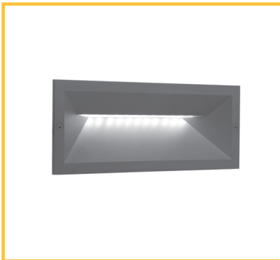
Wall Step Light WST250983065 12W 230V WW IP65