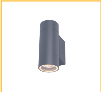
Wall Cylindrical Fixture ASWC061665 230V IP65