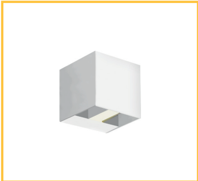
Architectural Serie Wall Cubic ASWC1010 2 x 5W 230V WW IP65