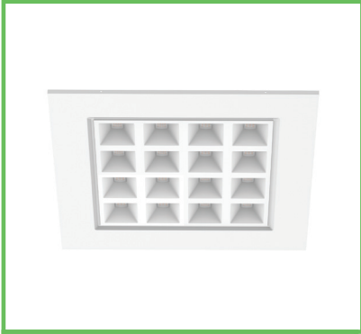
Square Modules Panel 595 x 595 36W IP20