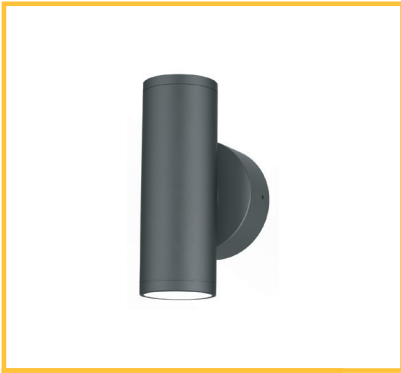
LED Wall Fixture Cylinder WFC IP65