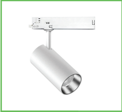
Track Light TL0612 IP20