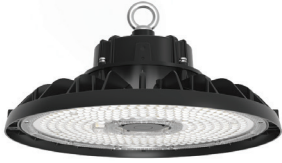
Highbay ECO 200W W IP65 G2