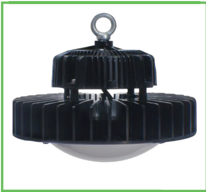
Highbay B-Bolt 150W NW IP65