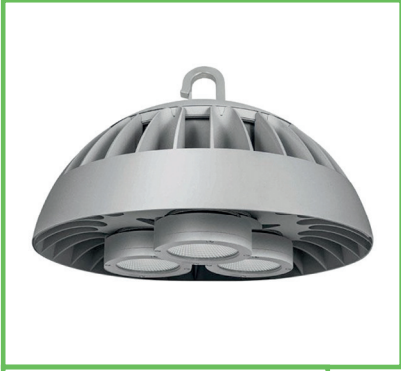
Highbay 3X 169W 220V W IP65