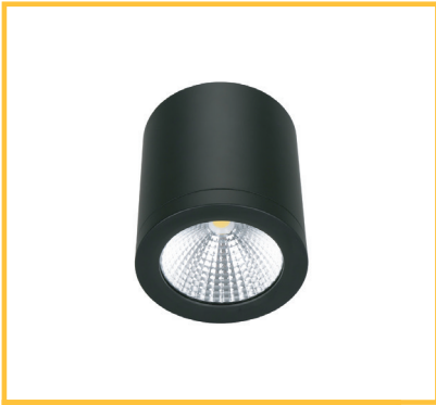
Cylindrical Surface Mounted Downlight DCSM0910 15W IP54