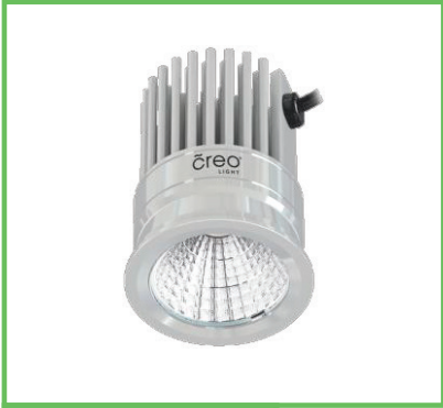
Spot PRO50 10W WW IP20