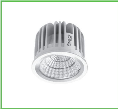
Spot PRO35 6W WW IP20