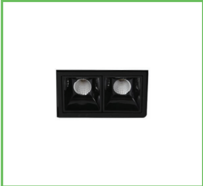
Architectural Serie Trimless Matrix ASMT0607 2x1 4W 700mA WW IP20