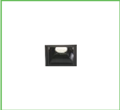
Architectural Serie Trimless Matrix ASMT0303 1x1 2W 700mA WW IP20