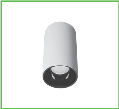
Architectural Serie Fixed Surface Mounted Downlight ASDFS0511 8W 230V WW IP20