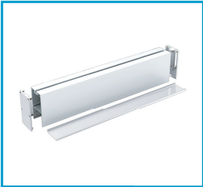
LED Profile PRO3567 IP20