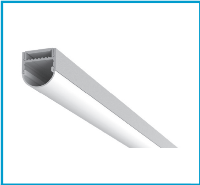
LED Profile PRO1922 Round IP20