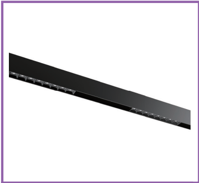
Infinite Track Profile 2321 8W IP40 LG