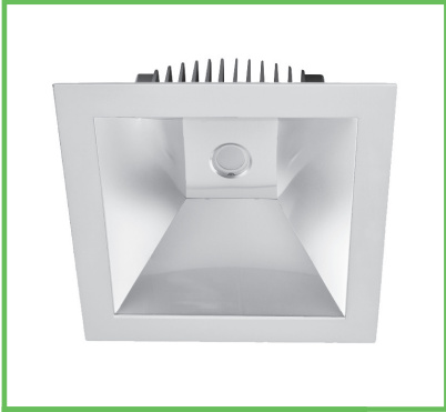
Zhaga Square Downlight DLZS08 37W IP44