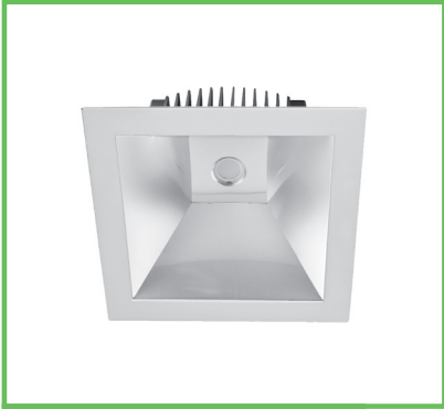
Zhaga Square Downlight DLZS06 25W IP44