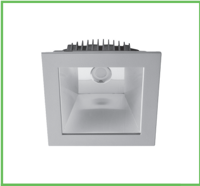
Zhaga Square Downlight DLZS05 17.3W IP44