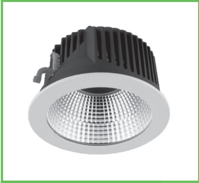
Zhaga Round Downlight DLZR06 25W IP44