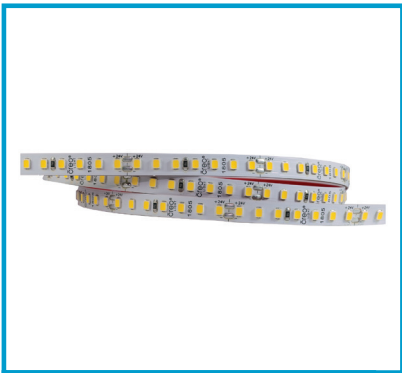
Flexible Strip G3 19.2W 24V IP20