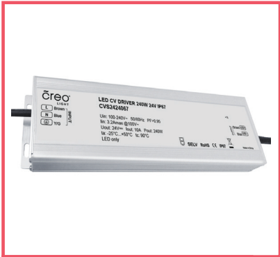
LED Slim Converter 240W 24V IP67