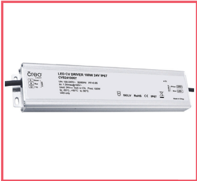
LED Slim Converter 100W 24V IP67