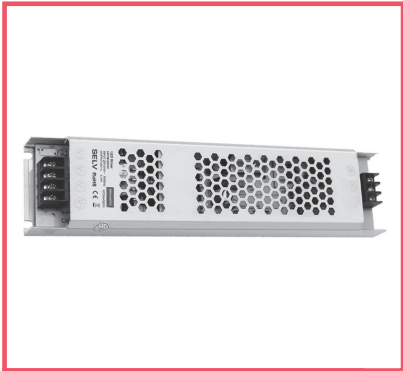
LED Slim Converter 100W 12/24V IP20