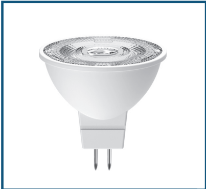
MR16 6.1W 12V WFL WW Dimmable G6 IP20