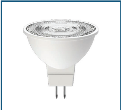
MR16 5.5W 230V WFL WW G8 IP20