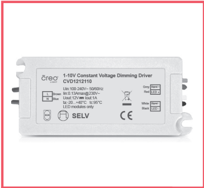
1-10V LED Driver 12W 12V IP20