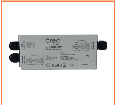
PWM Power Repeater 4 channels input 4 channels output IP67