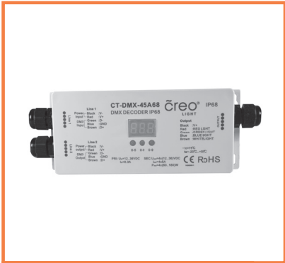
DMX LED Dimmer 2 channels input 4 channels output IP68